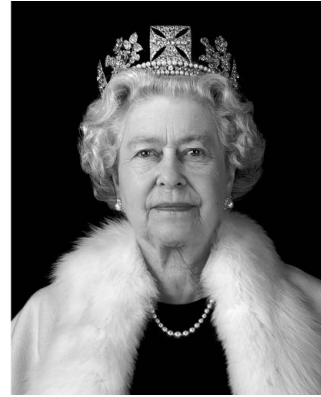
Her Majesty Queen Elizabeth II 1926 to 2022

I would like to welcome you all back to school after what I hope was a lovely, relaxing summer break. It has been a pleasure seeing the children back into school this week - spending time with their friends, laughing, playing and working hard! We have all missed them so much! Let's hope that this year proves to be yet another successful year at our school. If this week is anything to go by, then I am sure that it will be! The children have enjoyed a host of exciting lessons and activities already. Have a look at the photos below which perfectly capture what a fabulous week we've had. Thank you for your continued support.